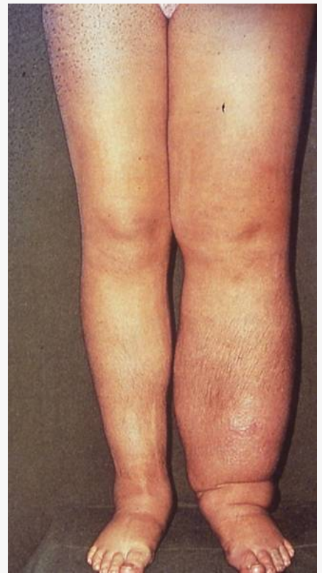
Lymphedema of the leg