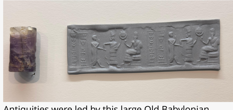
Antiquities were led by this large Old Babylonian amethyst seal, carved with Lamma introducing a worshiper to a seated god ($7,565).

B. O'Sickey (American, 1918-2013), titled Red Cloth, signed lower right and housed in a frame measuring 51 inches by 61 inches, gaveled for $9,834. Another O'Sickey work, this one not at large at 25 ½ inches by 30 inches (canvas, less frame), titled Garden with Potted Plants, changed hands for $2,269.