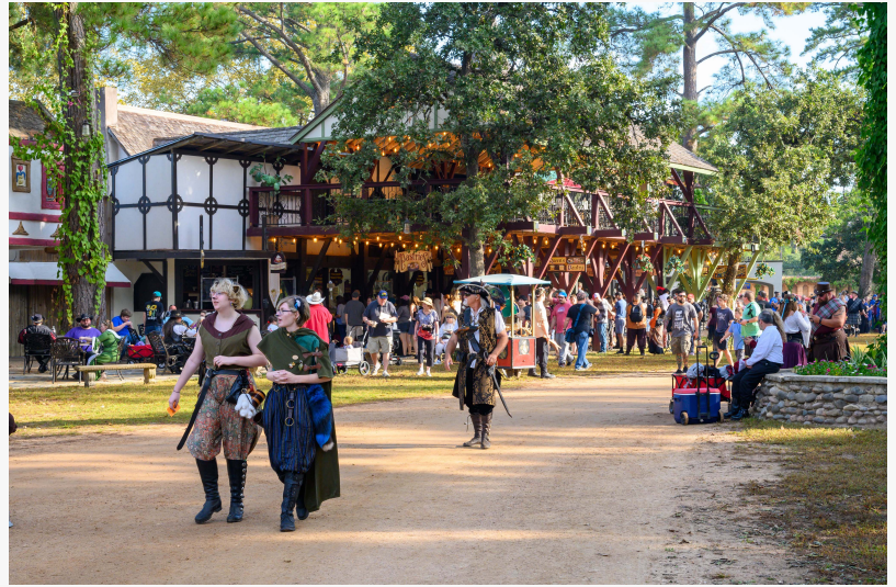
People enjoying the Texas Renaissance Festival at its 55-acre recreation of a 16th Century European village, one hour north of Houston