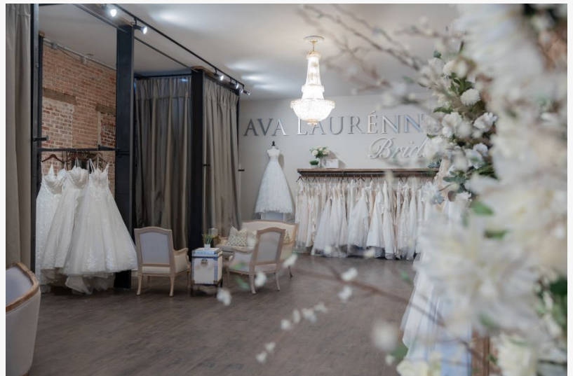
Brand New Location in Greenville, SC