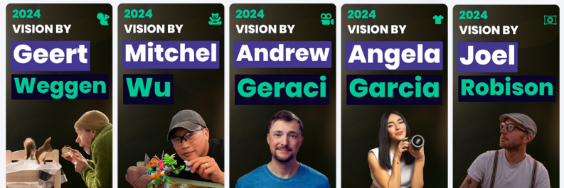
Unleashing the essence of photography