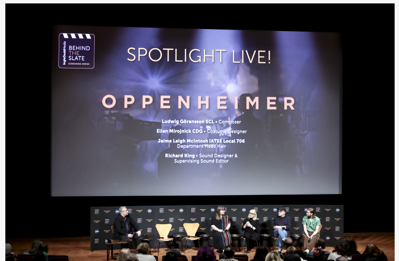
Artisans from MAESTRO at Spotlight Live! Behind the Slate panel