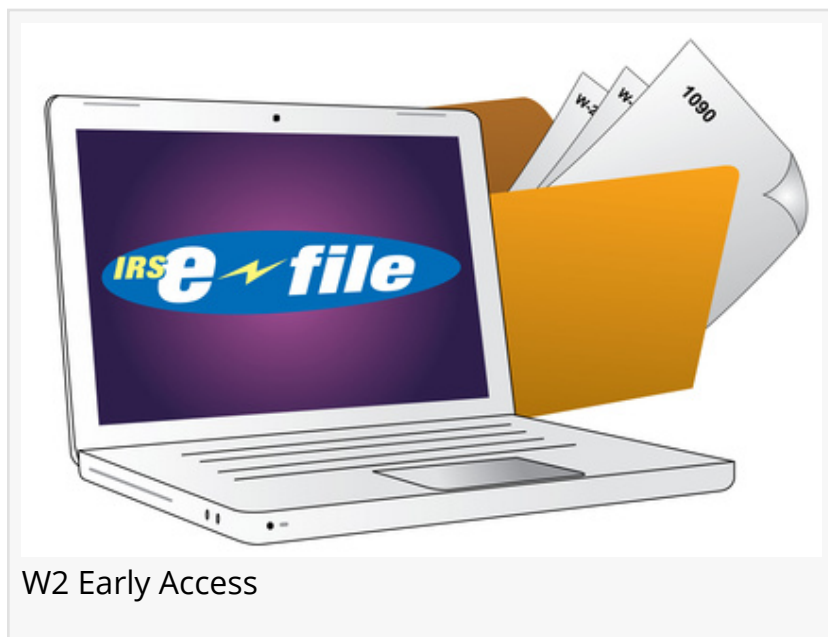
W2 Early Access

In addition to its speed, convenience, and security, the W2 Finder is also free to use. The platform is available at no cost, making it a great choice for anyone wanting to know how to find a W2 online.