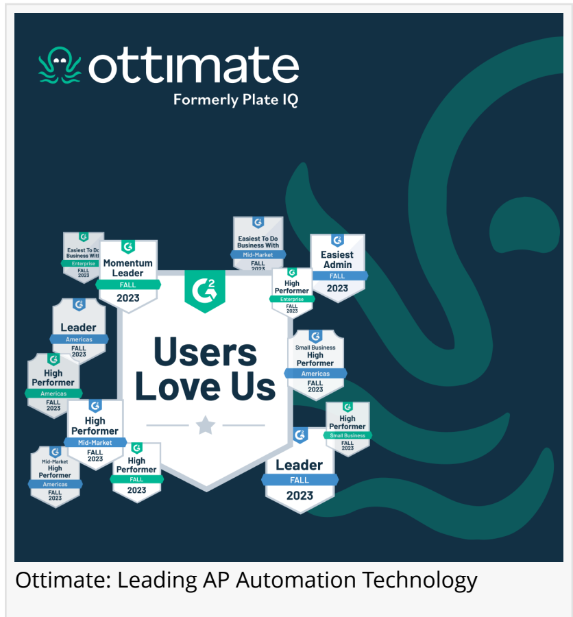
Ottimate: Leading AP Automation Technology