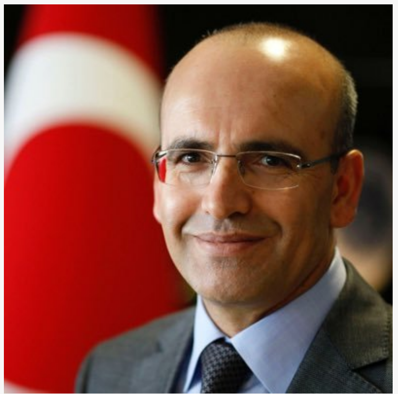
Mehmet Simsek, Minister of Finance, Republic of Türkiye

Ms. Hafize Gaye Erkan, the Governor of the Central Bank of the Republic of Türkiye will also join the Summit which is supported by the ASKON Headquarters, New York Chamber of Commerce and Industry, New Jersey Chamber of Commerce and Industry, African Chamber of Commerce and Industry, Korean Chamber of Commerce & Industry and Paterson Chamber of Commerce & Industry.