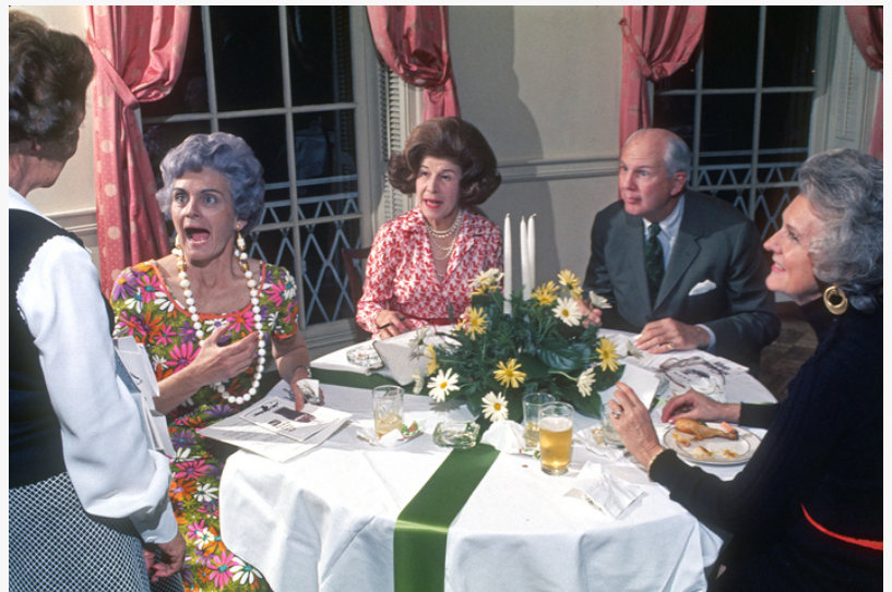
Glamorous dinner for the 1972 Atlanta Steeplechase crowd, referred to as "The Best Lawn Party in Georgia."