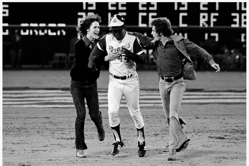
Hank Aaron hit his 715th homer to break Babe Ruth's record and ran the bases as two teenagers tapped him on his shoulders and ran off.