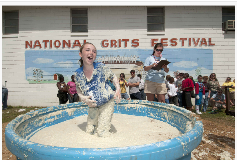
National Grits Festival from 2010, held in Warwick, Georgia, giving children and adults alike a day of fun and games..

This press release can be viewed online at: https://www.einpresswire.com/article/674674611