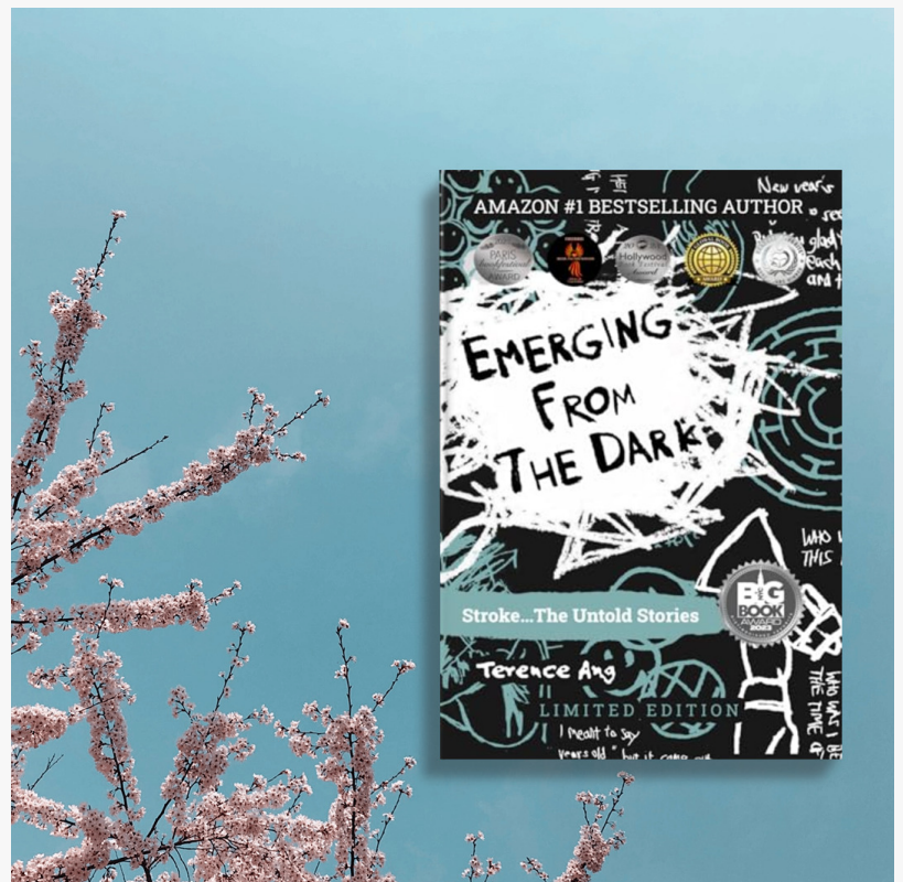
Emerging from the Dark...The Untold Stories