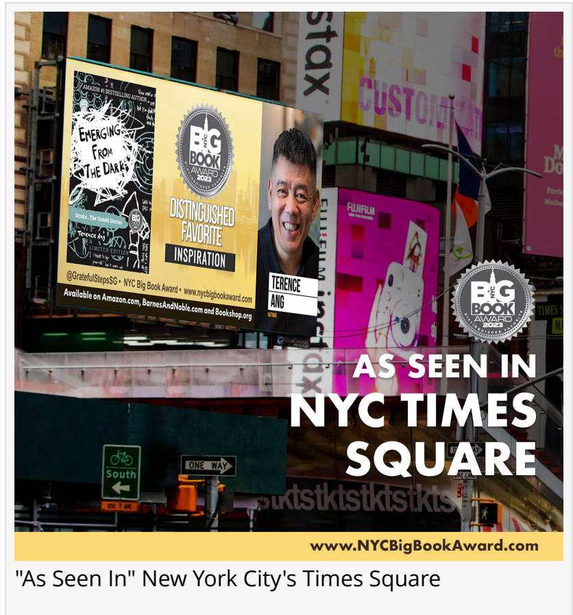
"As Seen In" New York City's Times Square