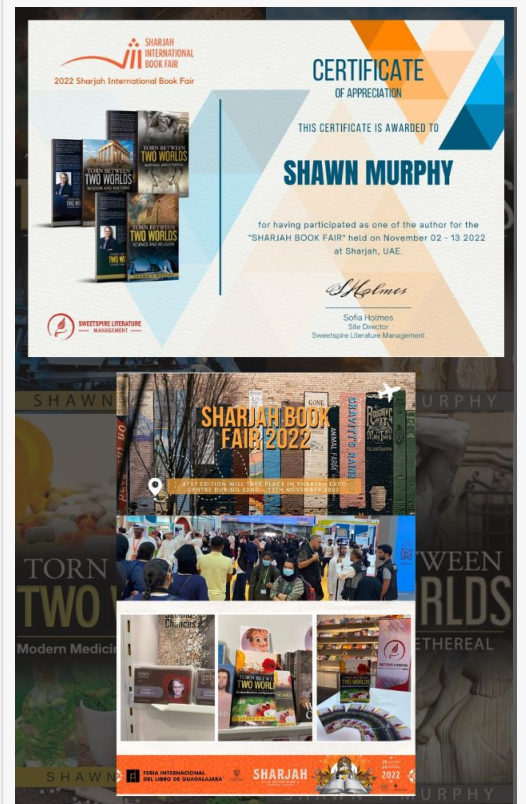
Sharjah Book Fair 2022