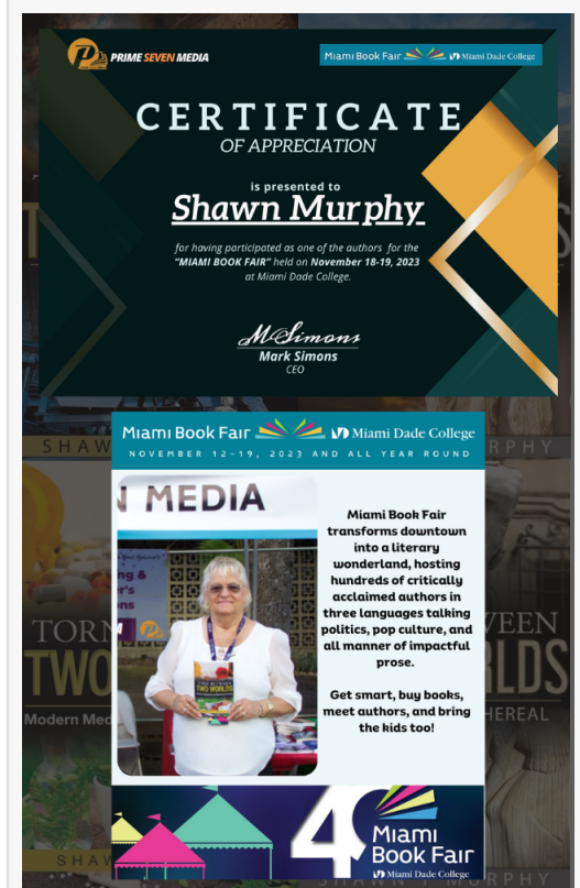
Miami Book Fair 2023