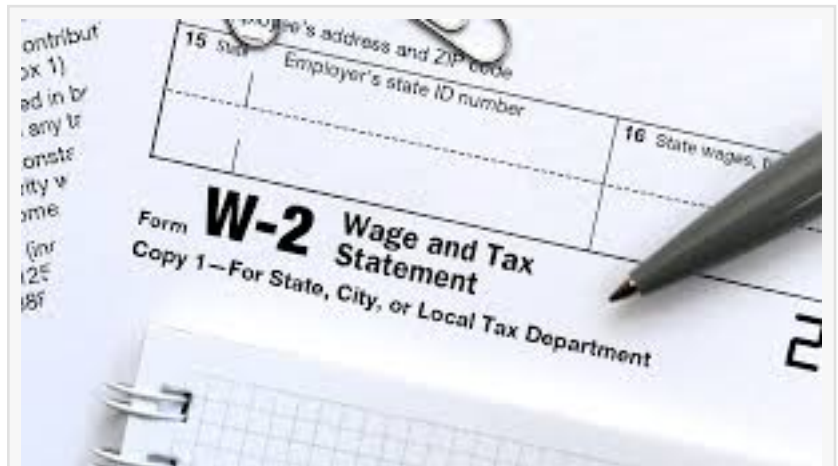
TurboTax W-2 Finder

24/7 Accessibility: Recognizing the diverse schedules of users, TurboTax provides 24/7 access to the W-2 lookup feature. This flexibility enables users to retrieve their W-2 forms at their convenience, aligning with modern lifestyles and varied time zones.