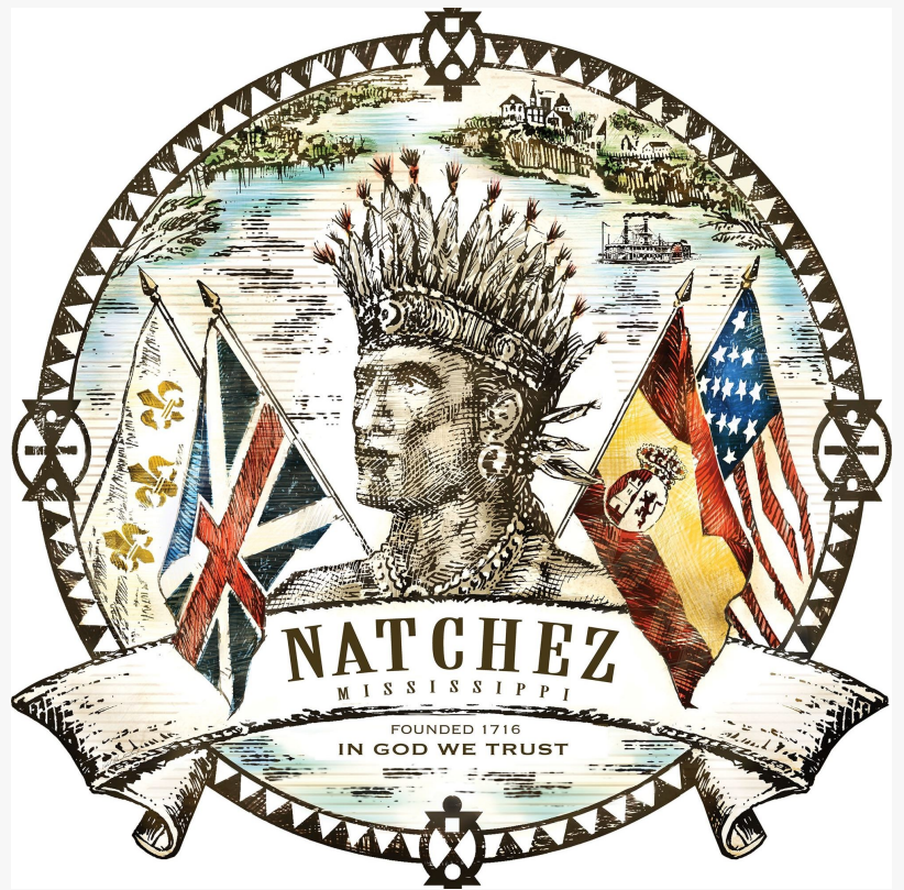
The official seal of the Historic City of Natchez