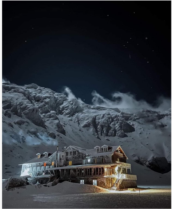
Every year another Ice Hotel is built at Bâlea Lac

The choice of this name for a room in the Ice Hotel is also linked to the launch of the "Cultural Routes Winter Experience in Romania by Historic Cafes Route ", the first tourism product of Historic Cafes Route Romania . The itinerary offers tourists from all over the world the opportunity to reach five well-known places in Transylvania, which are members of the Cultural Route in Historic Cafes Route (Chios Social Lounge Cluj Napoca, Hotel Transylvania Cluj-Napoca, Pardon Cafe Sibiu, Brukenthal Palace Avrig and Bâlea Lac Hut). Tourists may reach these places flying in the international airports of Cluj-Napoca or Sibiu.