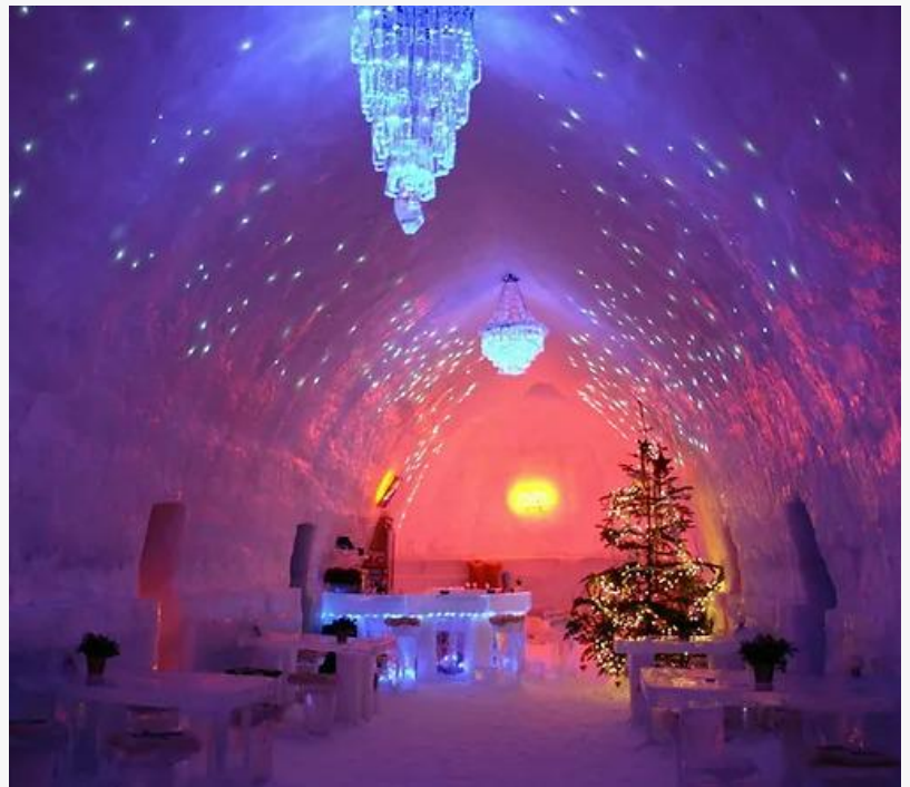
Ice Hotel in Bâlea Lac

The Historic Cafes Route is one of the 48 cultural routes officially acknowledged by the Council of Europe, routes that promote historical and cultural heritage, architecture, personalities,