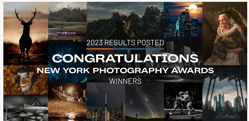
2023 New York Photography Awards Winners Announced