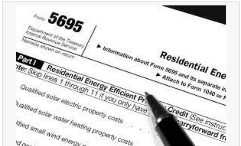
IRS Form 5695

The printable forms for the years 2023 and 2024 are available on the File My Taxes Online website and can be downloaded free of charge. Taxpayers can fill out the forms electronically or print them out and complete them manually.