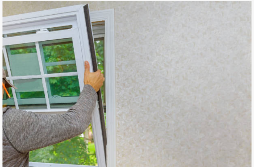
Home Improvement Energy Efficient Tax Credits