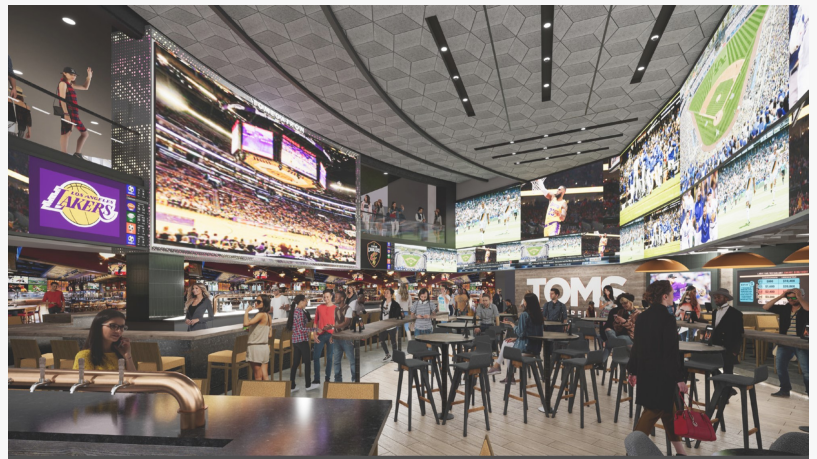
Tom's Watch Bar Interior