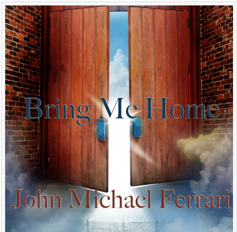
Bring Me Home