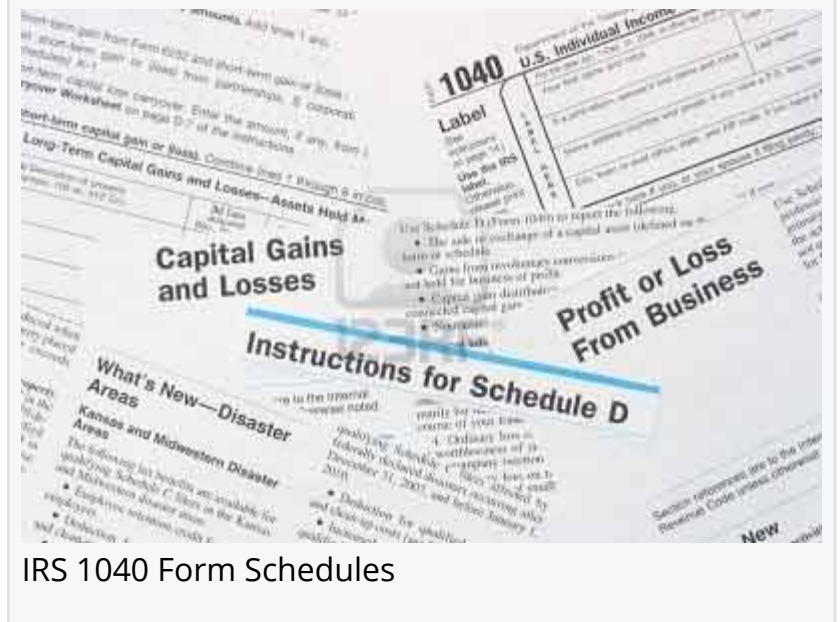
IRS 1040 Form Schedules

This press release can be viewed online at: https://www.einpresswire.com/article/675415792