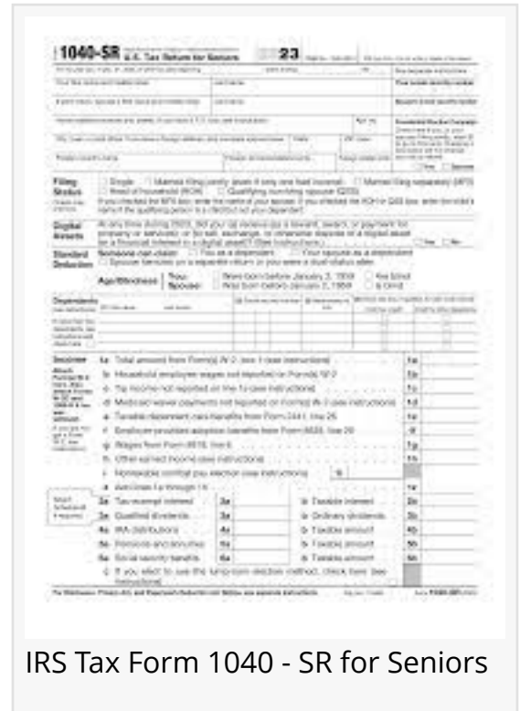
IRS Tax Form 1040 - SR for Seniors

To ensure a smooth and hassle-free tax filing experience , the IRS recommends that taxpayers review the instructions carefully and gather all necessary documents before filling out the form. It is also important to double-check all information for accuracy before submitting the form.