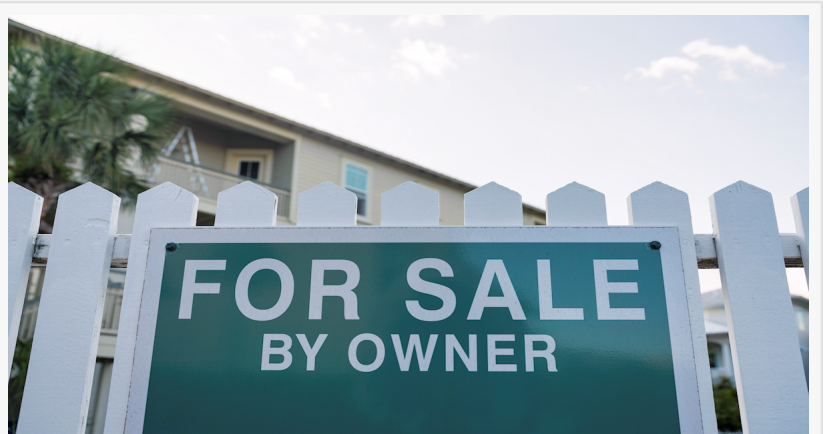
Cash For Houses RI

Selling residential real estate through professional buyers declutters the home-selling process and eliminates the need to go through traditional hassles like listing, staging, and waiting for the right buyers.