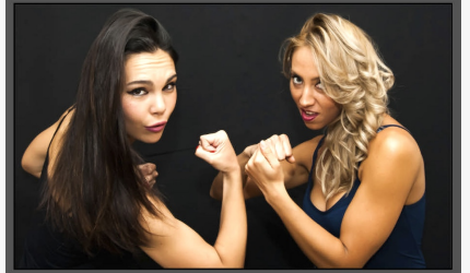
Characters who test the patience of police officers.

This press release can be viewed online at: https://www.einpresswire.com/article/675626099 EIN Presswire's priority is source transparency. We do not allow opaque clients, and our editors try to be careful about weeding out false and misleading content. As a user, if you see something we have missed, please do bring it to our attention. Your help is welcome. EIN Presswire, Everyone's Internet News Presswire™, tries to define some of the boundaries that are reasonable in today's world. Please see our Editorial Guidelines for more information. © 1995-2024 Newsmatics Inc. All Right Reserved.