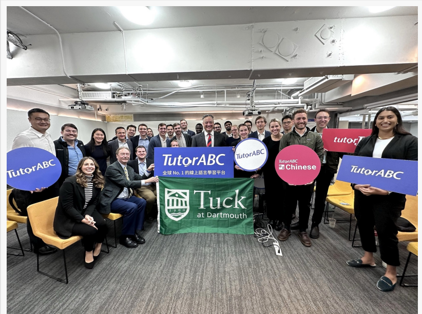
TutorABC welcomes the MBA students and professors from Dartmouth's Tuck School of Business.

This is the program's first ever trip to Taiwan, which included over 25 MBA students and professors from Tuck, who embarked on a 10-day educational journey across the country. Their itinerary included visits to renowned organizations such as TutorABC, TSMC, Foxconn, Google, Uber, as well as various biotech and tech startups. This immersive experience allowed the students to gain valuable insights into Taiwan's vibrant business