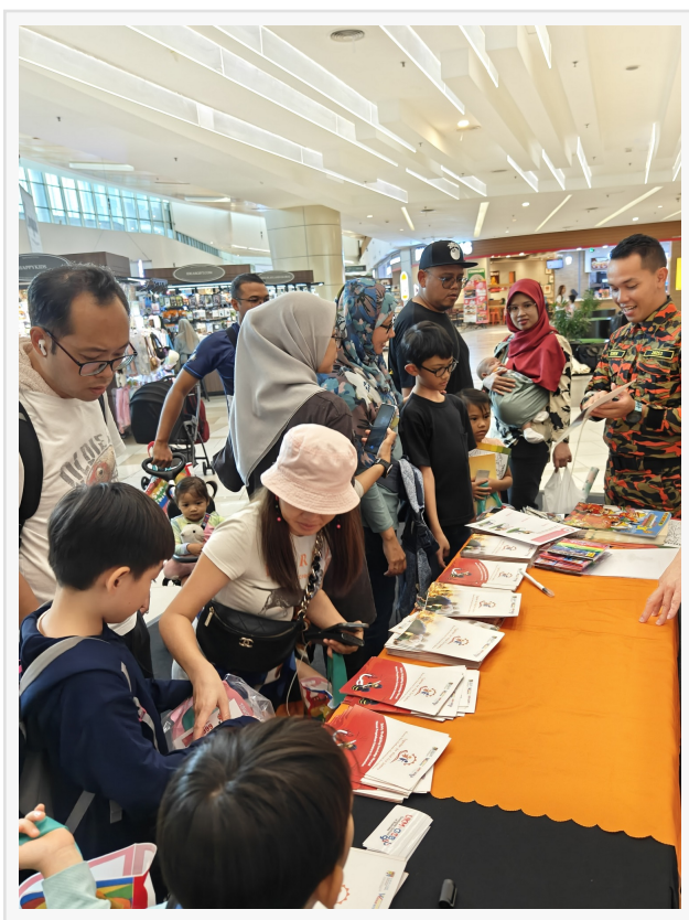
The National University of Malaysia

This press release can be viewed online at: https://www.einpresswire.com/article/675796377