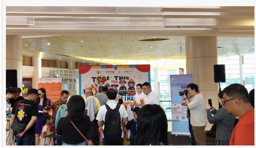
The National University of Malaysia