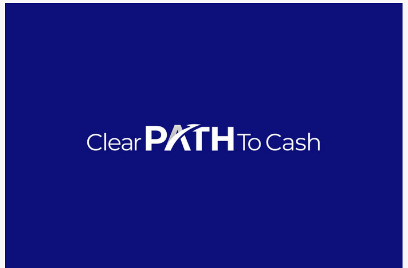
Clear Path To Cash Logo