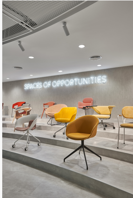
KPS Mart® is an independent business-to-business furnishing resource.