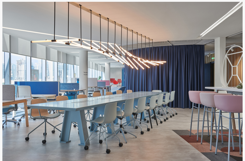
Mart® is the independent furnishing arm of KPS headquartered in D3