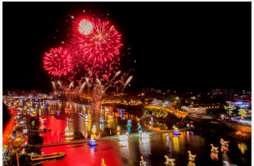
Jinju Namgang Yudeung Festival