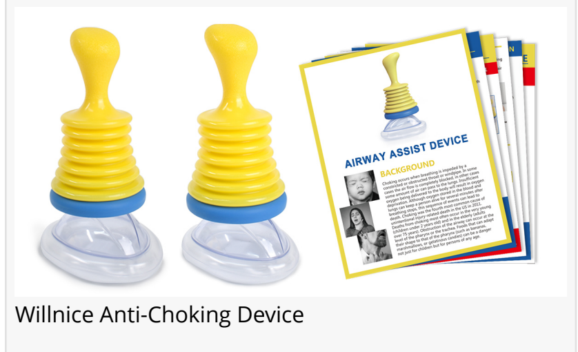
Willnice Anti-Choking Device