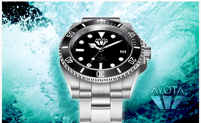
Impression - AYOTA Watches – Vienna – Austria | Watches & Gains | PremiumShop.com