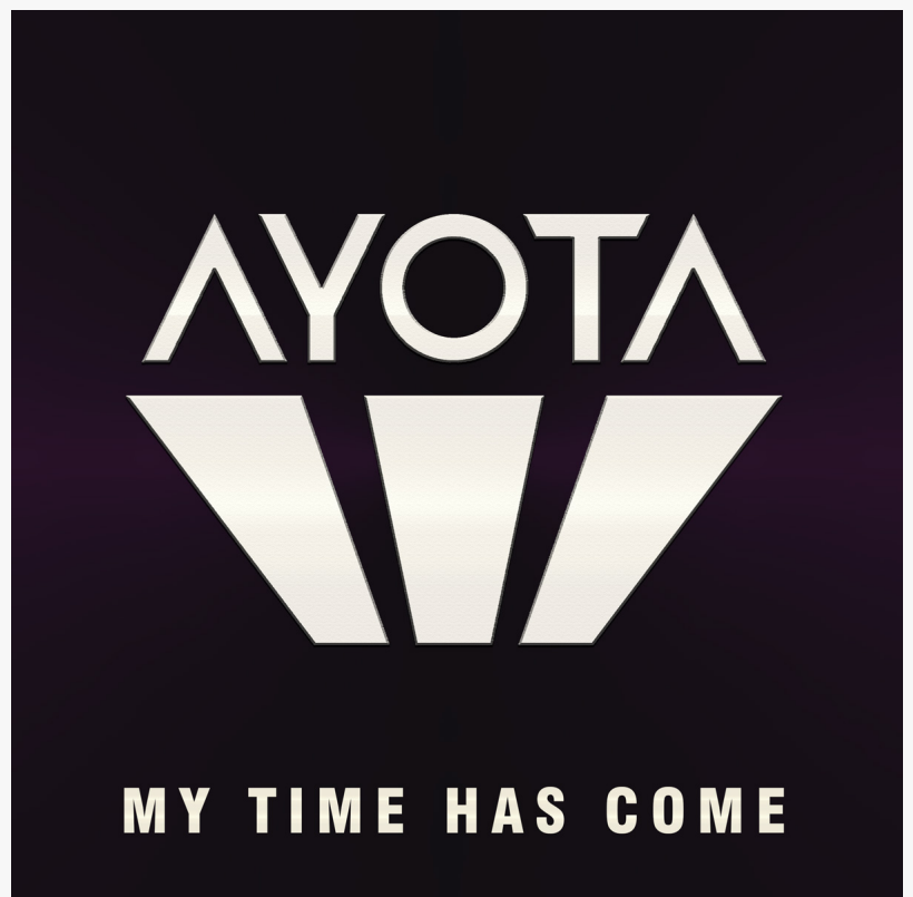
Logo - AYOTA Watches – Vienna – Austria | Watches & Gains | PrimiumShop.com

AYOTA already ran the first campaign of its First Edition on Kickstarter and was successful in just one day. Those familiar with Kickstarters pledge and reward system have the opportunity to back AYOTA and receive their rewards at discounted prices until 17th of January.