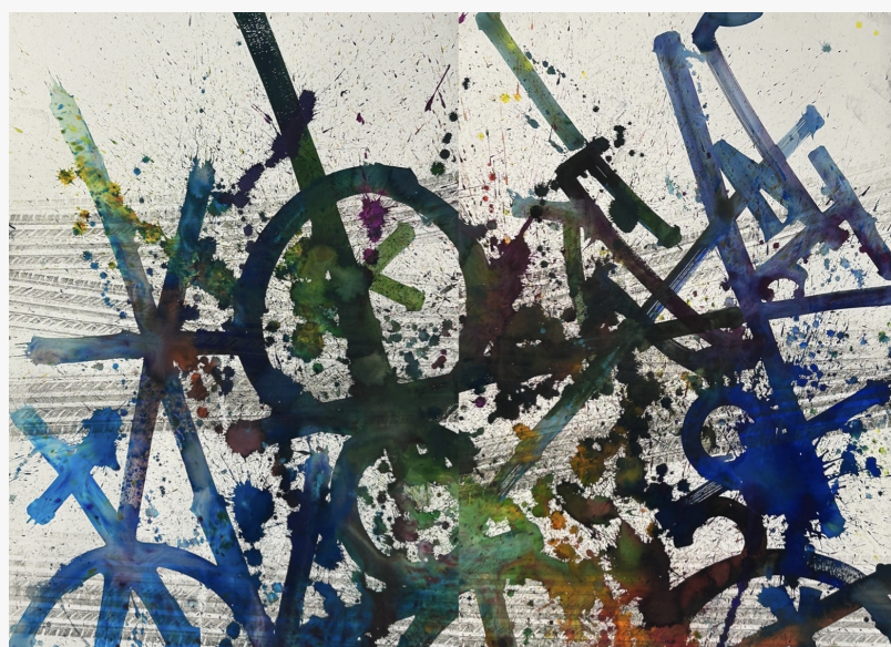
Diptych 1, RETNA

This press release can be viewed online at: https://www.einpresswire.com/article/676092712