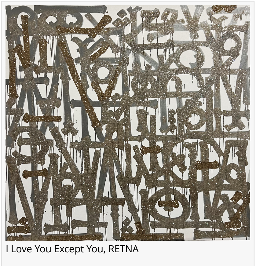
I Love You Except You, RETNA

Burgess Modern + Contemporary invites you to experience the transformative power of RETNA - "Appetite for Destruction". It is a rare opportunity to engage with artworks that encapsulate the cycle of destruction and rebirth, challenging the boundaries of artistic expression and offering a profound commentary on the nature of creation itself.