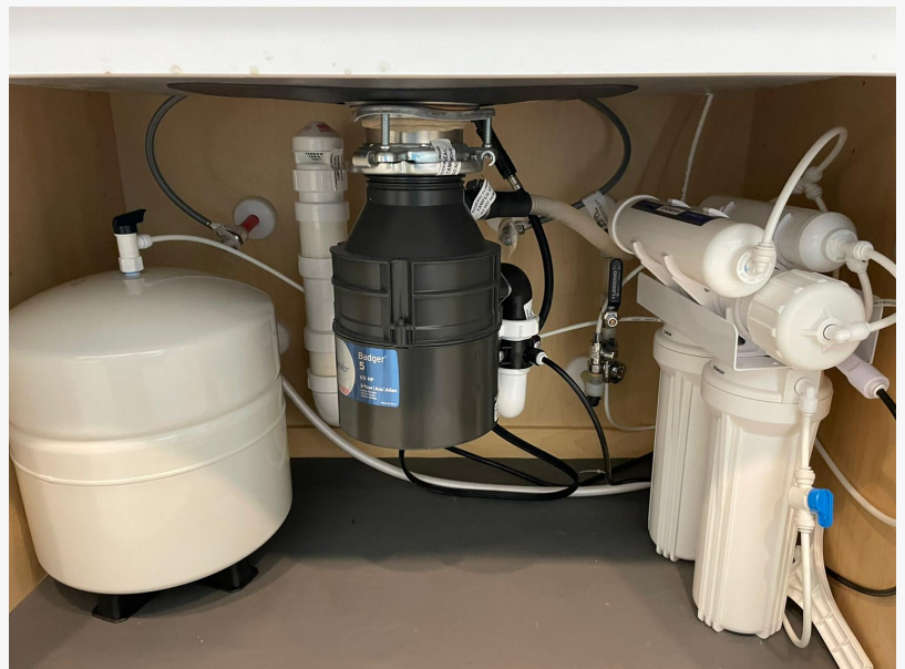
Reverse Osmosis System in Port St Lucie