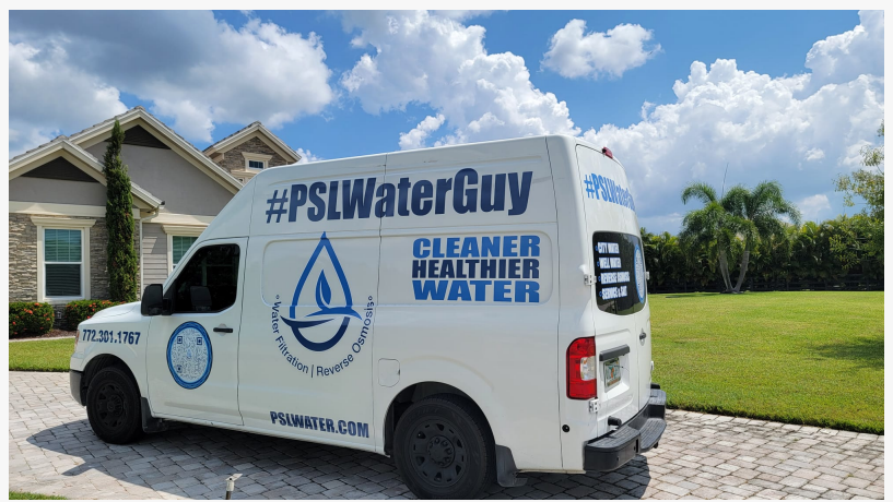
PSL Water Guy

"We understand people want assurance their families have access to clean, safe water. That's