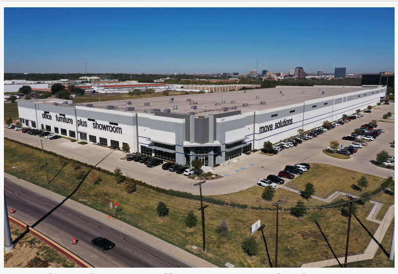
Outside or the New Office Furniture Plus location

Choosing repurposed office furniture is an economically sensible choice that also benefits the environment. It reduces the need for new manufacturing, thereby decreasing waste and contributing to a smaller carbon footprint. Additionally, repurposed office furniture can bring a unique aesthetic to an office, reflecting the company's culture and values. Office Furniture Plus is addressing the needs of businesses looking for sustainable and cost-effective office furnishing solutions. Their approach to combining new and used furniture offers a practical option for those seeking to balance needs, esthetics, and economy with environmental responsibility.