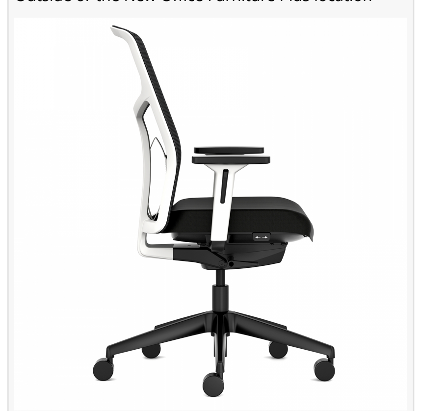
Office Seating is another good place to blend old and new office furniture