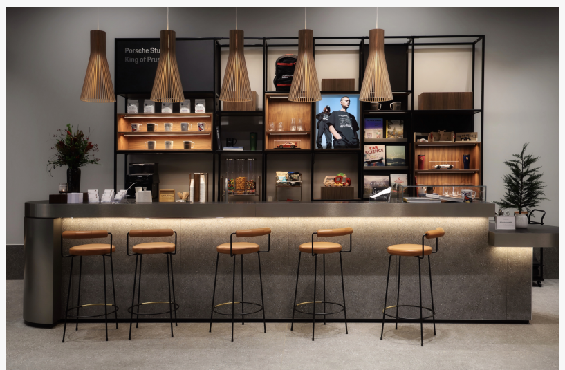
The coffee bar located inside the Porsche Studio King of Prussia

PHILADELPHIA, PA, USA, December 20, 2023 /EINPresswire.com/ -- This digital and tactile ecosystem represents a pivotal moment in the realm of luxury car buying, seamlessly combining cutting-edge technology with the brand's iconic craftsmanship to redefine the customer experience.