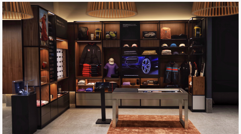
Shop the latest Porsche Design Merchandise at the Porsche Studio King of Prussia