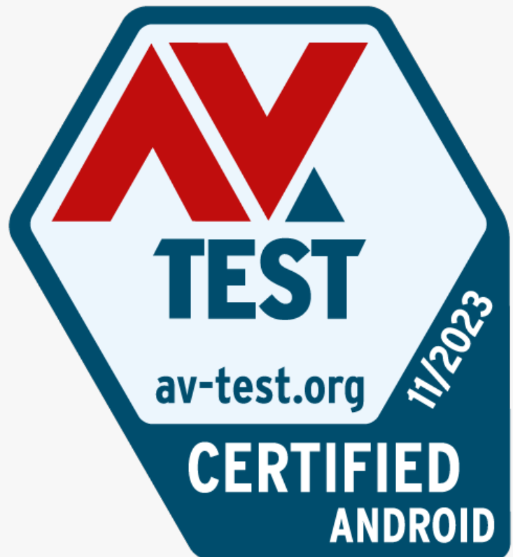
AV-TEST certified mobile security for Antivirus AI Android by Protectstar