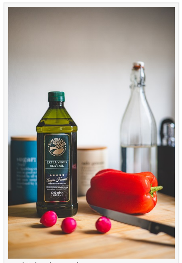
turkish olive oil

Olive oil has long been cherished for its culinary versatility and numerous health benefits. While the Mediterranean region is renowned for producing some of the finest olive oils globally, Turkey has been making its