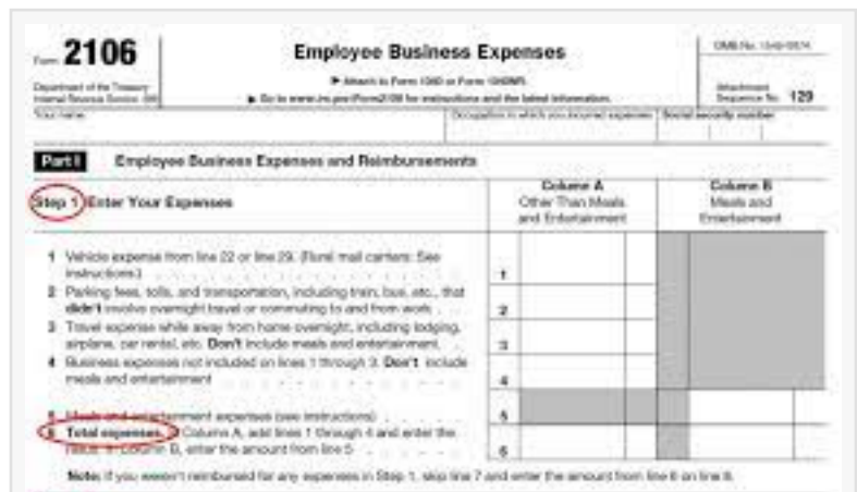
IRS Tax Form 2106

Taxpayers can also find information on what records they need to keep to support their claims, as well as how to report their expenses when filing their tax return .