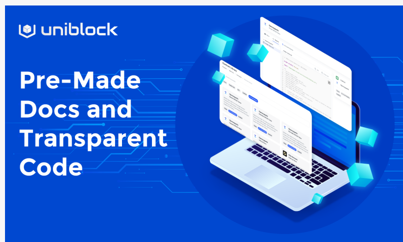
Pre-made Docs and Transparent Code