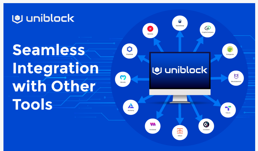
Seamless Integration with Other Tools