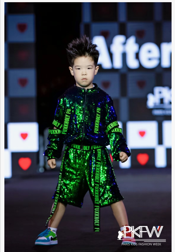
Paris Kids Fashion Week