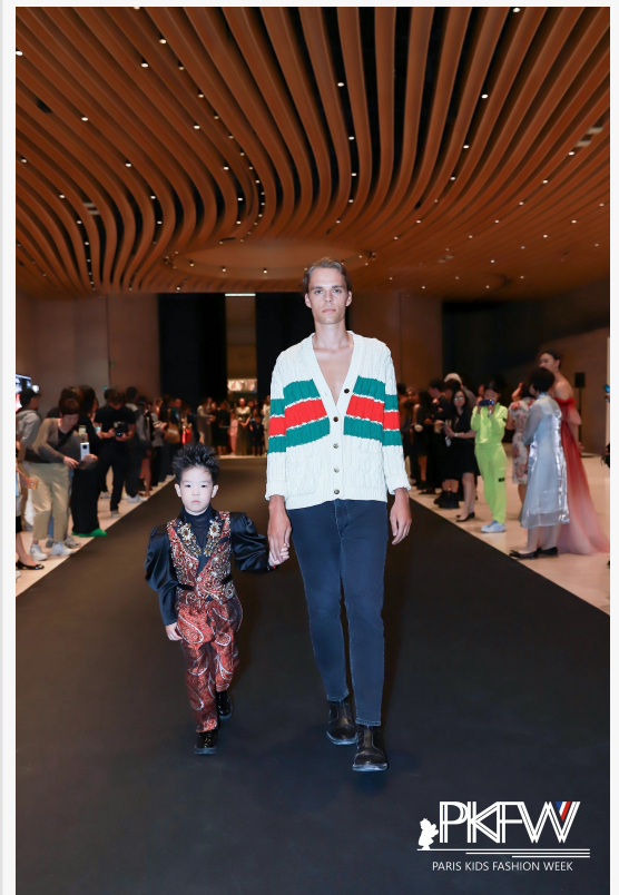
Paris Kids Fashion Week

Wang Dong'en followed with a skillful performance on the grand national stage that was not only entertaining but also showcased the charm and richness reflecting its culture. Spectators