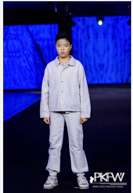
Paris Kids Fashion Week