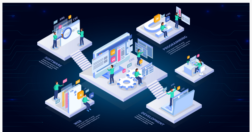
Dart Digital Agency

Today, it's easily comprehensible that this generation has more money to spend than the previous ones. With the complete shift of purchasing power to the younger generation in a few years, brands have started to alter their strategies accordingly. That's what Dart Digital specializes in; through its visionary approach, the agency has already been a champion of innovative concepts that entice modern users while staying bound by its roots. They are also among the ones sustaining and supporting their traditions and heritage by integrating elements inspired by their homeland in all of their web designing and development works. These experts also play the role of digital advisors for even new and emerging companies through self-made principles, years of expertise, and insights.