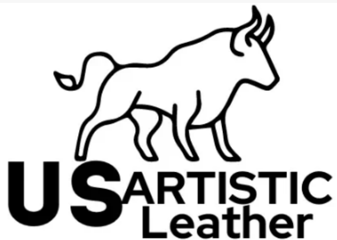
US Artistic Leather Logo

High Quality RAW Material - Environmental Friendly - US Artistic Leather