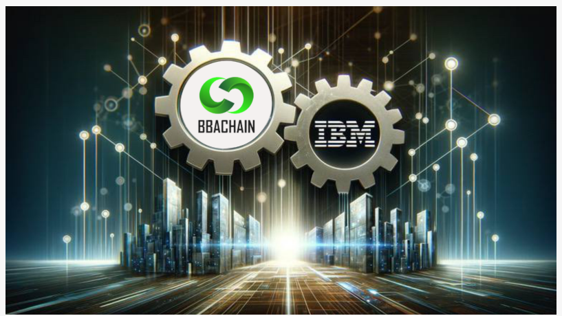
BBACHAIN and IBM

Since its inception in October, BBACHain has experienced a meteoric rise, rapidly expanding its community and forging strategic partnerships. This dynamic growth has been reflected in the market, with the BBA coin witnessing an impressive 50% increase in value since the mainnet launch. The launch of the BBA crypto wallet further solidifies the company's commitment to providing comprehensive blockchain solutions.