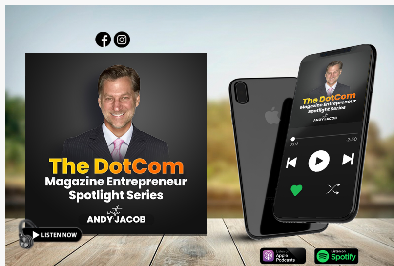
The DotCom Magazine Entrepreneur Spotlight Series-Cover Story