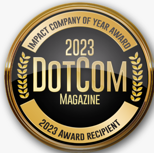
The DotCom Magazine Entrepreneur Spotlight Series- Impact Company

DotCom Magazine is a leading news platform providing fascinating interviews with news makers, thought leaders, and entrepreneurs. DotCom Magazine is the leader in putting people with insatiable entrepreneurial spirit at the forefront of every story it covers. The Entrepreneur Spotlight Interview Video Series looks at business through the lens of a successful entrepreneur’s mindset. The Entrepreneur Spotlight Series has included high-profile leaders, including Inc 500 founders, Ted Talk presenters, ABC Shark Tank participants, venture backed visionaries, prolific CEO’s and Founders, and many other wonderful thought leaders and entrepreneurs. DotCom Magazine covers Founders and CEO’s making a difference. Regardless of who the entrepreneur is, where they live, or what they are doing, if it is interesting and newsworthy, DotCom Magazine covers it. In selecting entrepreneurs for this important video series, we consider the newsworthiness of the story and what our viewers want to learn about. If something is important to our viewers, it is important to DotCom Magazine. The people at DotCom Magazine believe in including a diverse range of entrepreneur voices in our interviews, and actively pursuing entrepreneurs making a positive difference in the world.