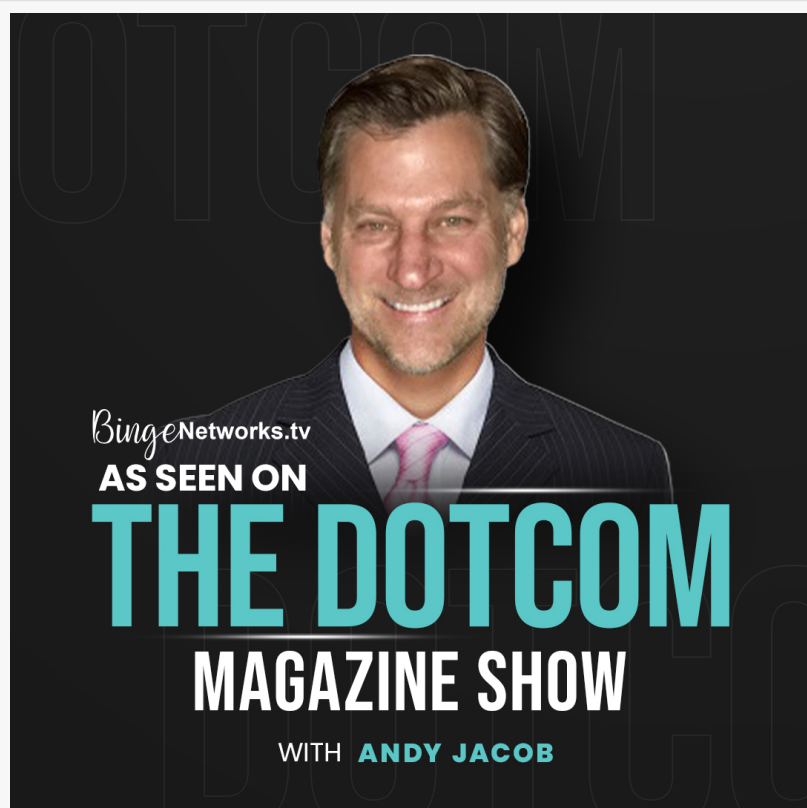
The DotCom Magazine Entrepreneur Spotlight Series-Featured Interview