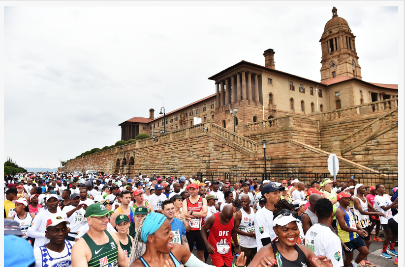
With the Capitals Union Buildings in the background the Mandela Run begins