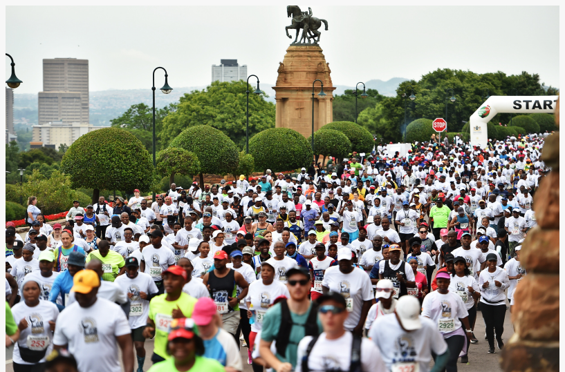
Thousands turned out to remember the legacy of Nelson Mandela

Mahindra South Africa joined hands with the Nelson Mandela Foundation to host this weekend's event; "for Mahindra, we are excited to be part of this celebration, especially commemorating 10