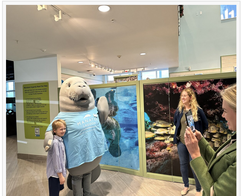
The Coastal Stewards - Winter Wishes Event