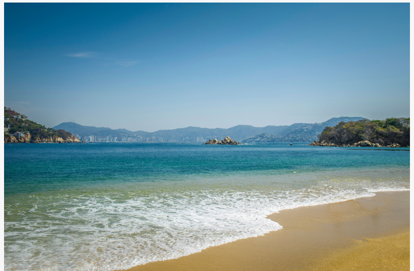
Roqueta Island in Acapulco, a natural beauty ready to welcome travelers