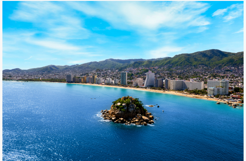
The beauty of Acapulco Bay is ready to welcome you

SPRING, TX, UNITED STATES, December 22, 2023 /EINPresswire.com/ -- Acapulco, the jewel of Mexico's Pacific coast, proudly announces its extraordinary recovery process and its readiness to welcome travelers this holiday season. This announcement comes after dedicated efforts to revitalize the city in the aftermath of Hurricane Otis.