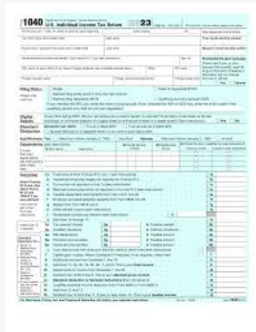
Printable IRS Tax Forms