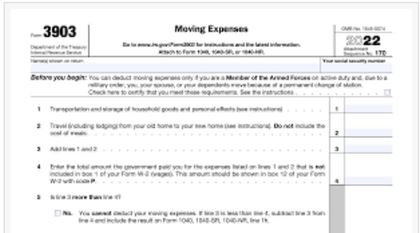
IRS Tax Form 3903

The new forms and instructions reflect the changes made by the Tax Cuts and Jobs Act (TCJA) of 2017, which eliminated the deduction for most job-related moving expenses for tax years 2018