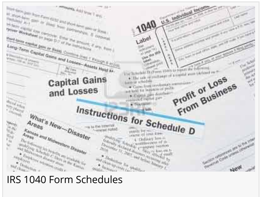
IRS 1040 Form Schedules

- Taxpayers can now deduct up to 100% of their charitable contributions, up from the previous limit of 60%.