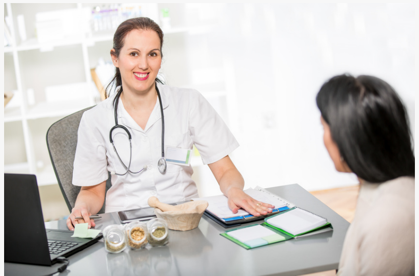
Medical Expenses Tax Deduction