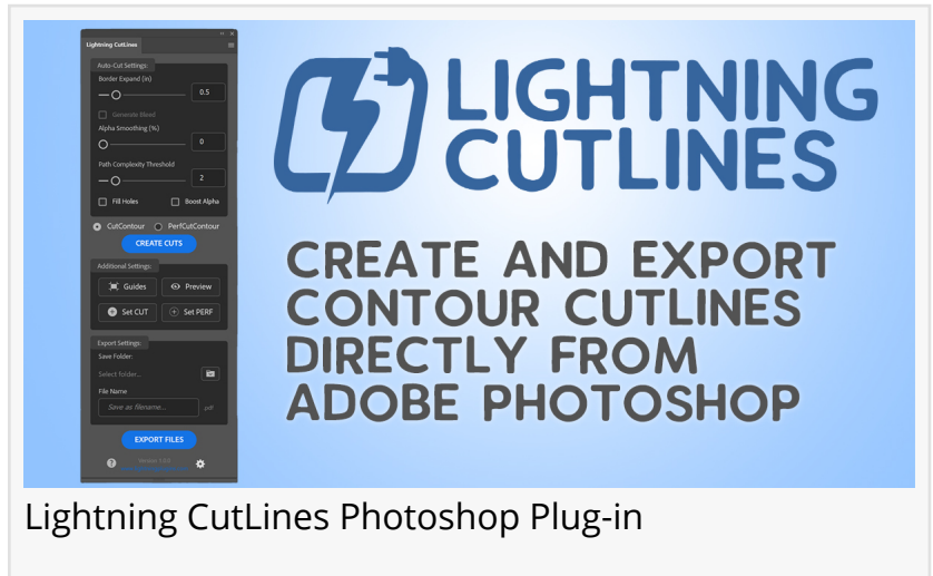
Lightning CutLines Photoshop Plug-in

Developed by Lightning Plugins , Lightning CutLines was initially intended to assist photographers