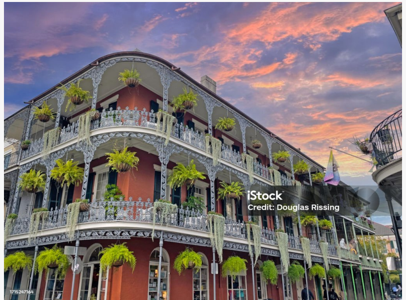
Famous French Quarter

The Historic Mardi Gras Inn, located within walking distance of all festival events, serves as the